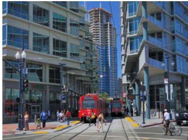
Downtown San Diego's "Smart Corner" is built to support pedestrian activity and includes convenient trolley service.

SB 375 authorizes local governments to require project developers to provide street or road improvements, traffic control improvements, transit contributions, transit passes, or other measures. SB 375 does not limit the authority of a local government to determine what mitigation measures are appropriate for different types of transit priority projects.