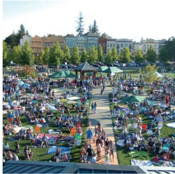
LOIS FISHER, FISHER TOWN DESIGN

The town of Windsor, California, has implemented plans and policies that reduce sprawl, preserve farmland, and revitalize the downtown area.