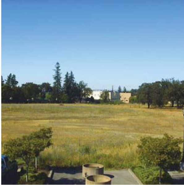
LOIS FISHER, FISHER TOWN DESIGN