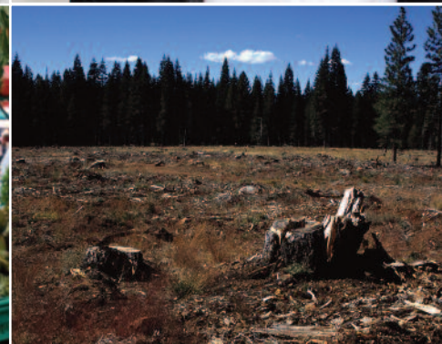
Photos: (Left) Causa Justa/Just Cause rally, Oakland, CA. (Upper center) Hands of a farmworker. (Lower center) Porto Palazzo, Torino, Italy. (Upper right) Causa Justa Valentines Day Action. (Lower right) Sierra clearcut. (Front cover, upper) Mural in Oakland.